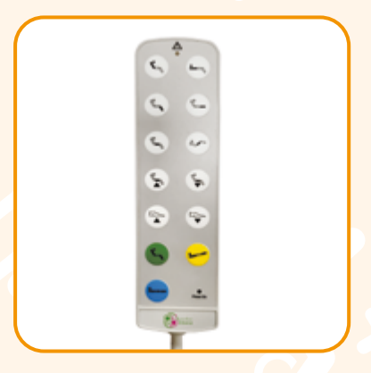
13 BUTTONS HANDSET WITH 3 MEMORIES